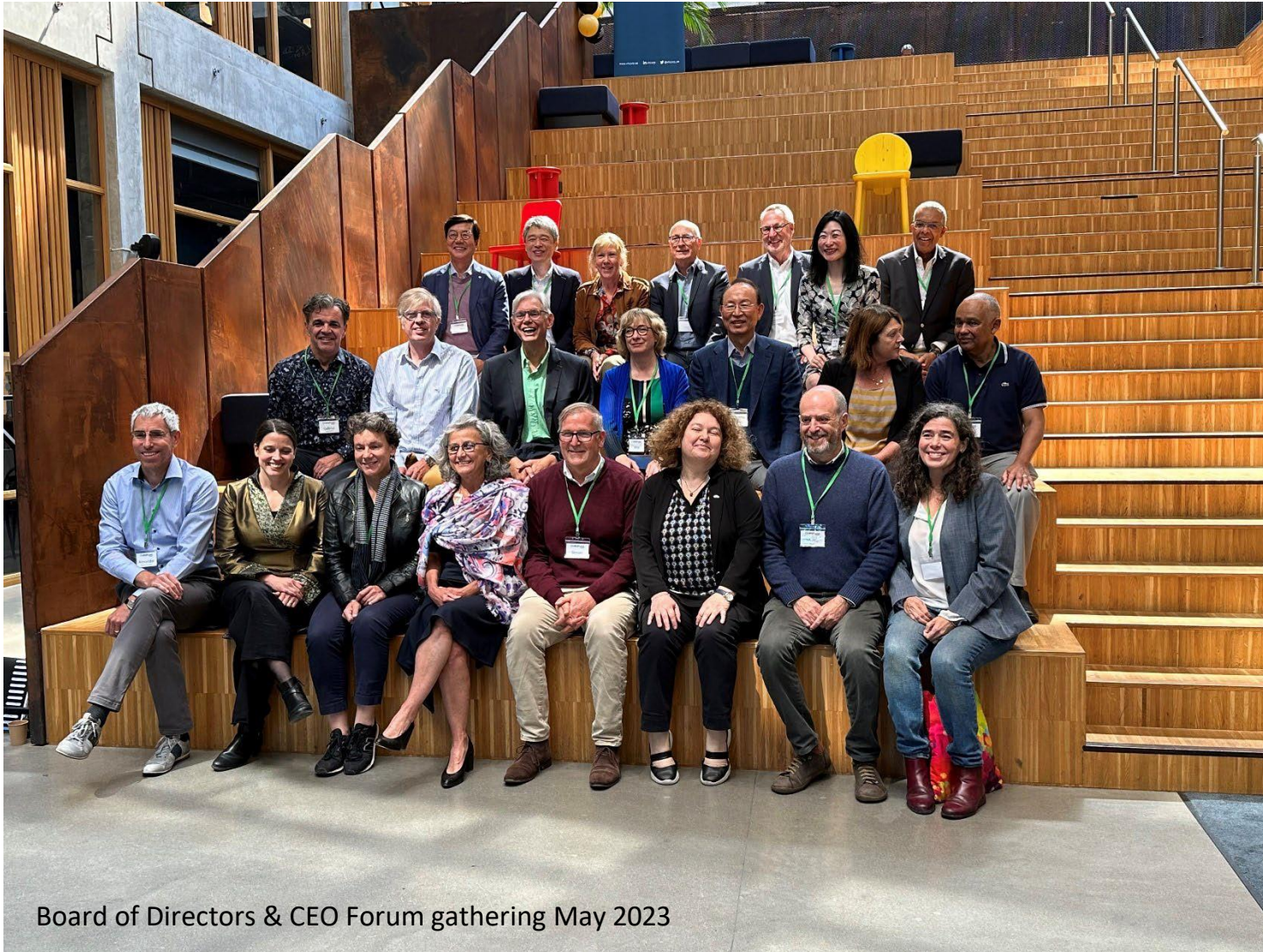
Board of Directors & CEO Forum gathering May 2023